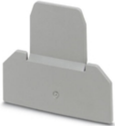
Partition plate, length: 64 mm, width: 2.5 mm, height: 56 mm, color: gray

Please be informed that the data shown in this PDF Document is generated from our Online Catalog. Please find the complete data in the user's documentation. Our General Terms of Use for Downloads are valid ( http://phoenixcontact.com/download )